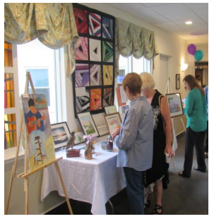
Residents and staff admire paintings, drawings, wood carvings, ceramics, and needlecraft.